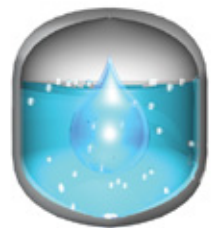
Activated Oxygen Injection