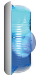
80 GPD Reverse Osmosis Membrane